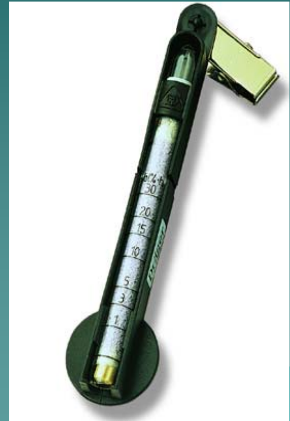
Drager diffusion tube