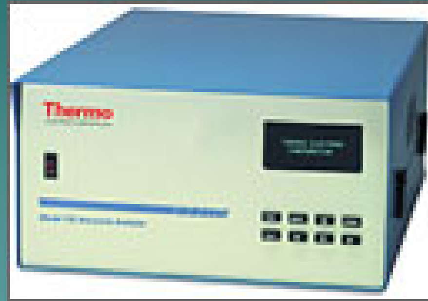
Thermo Electron Corp. Model 17C